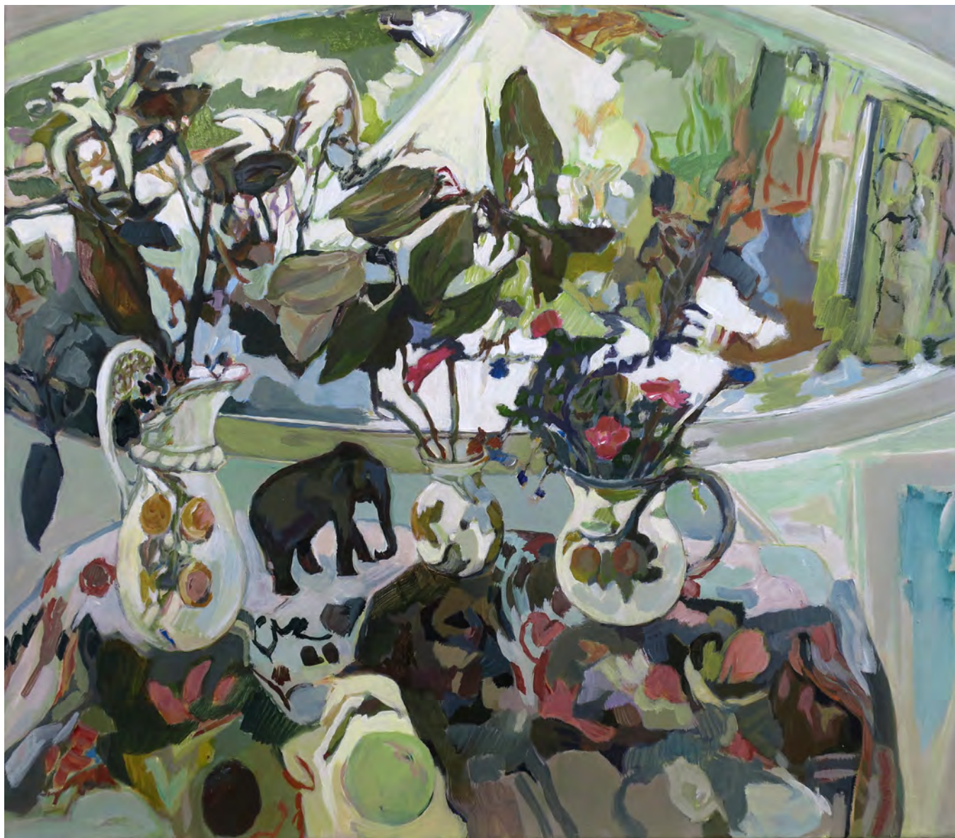
Elephant in the Room acrylic on canvas 70 x 80cm 2020