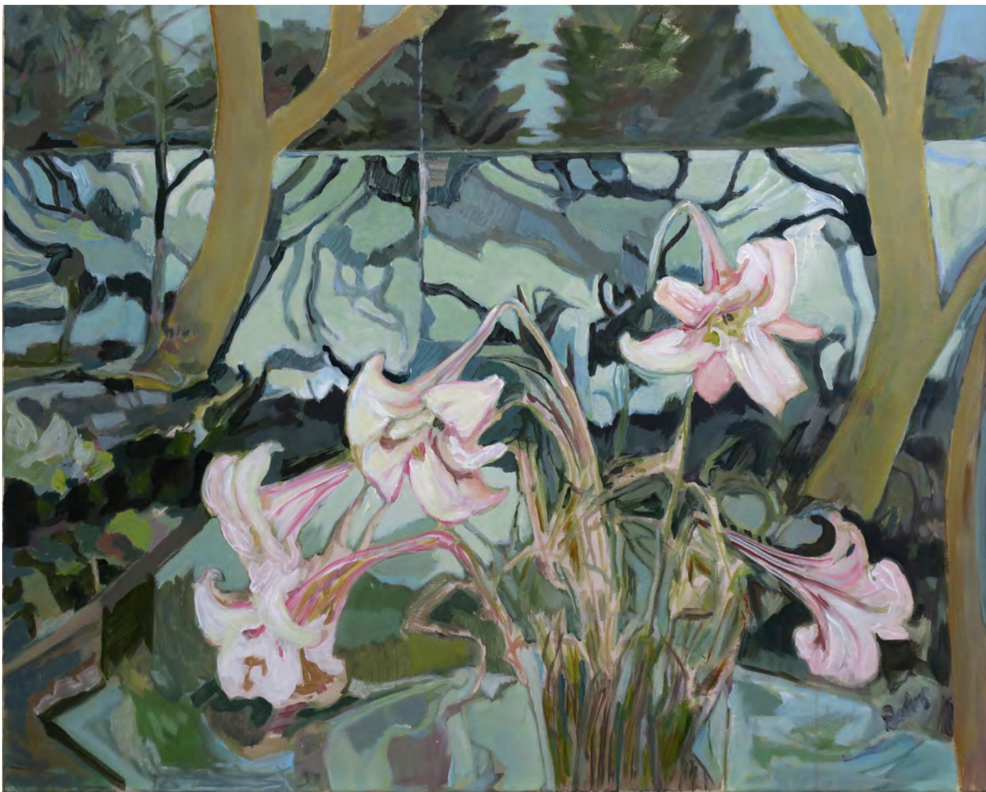
Garden Shadows acrylic on canvas 61 x 76cm 2020