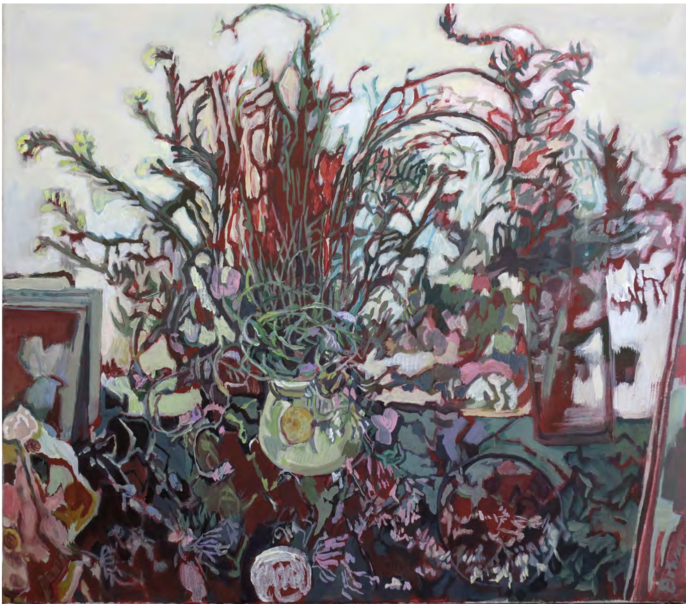
Wildflowers acrylic on canvas 70 x 80cm 2020