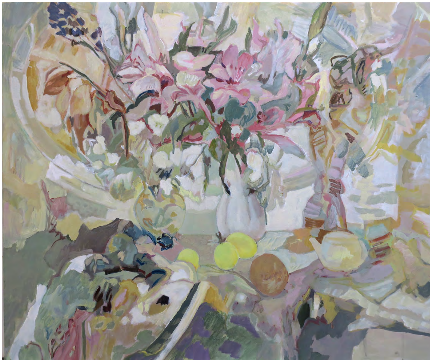
Lost Lilies acrylic on canvas 80 x 95cm 2020