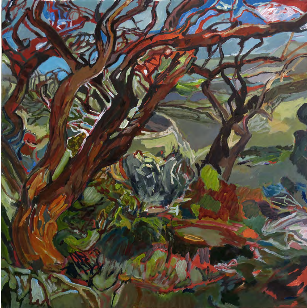
Pygmy Possum Habitat acrylic on canvas 60 x 60cm 2019