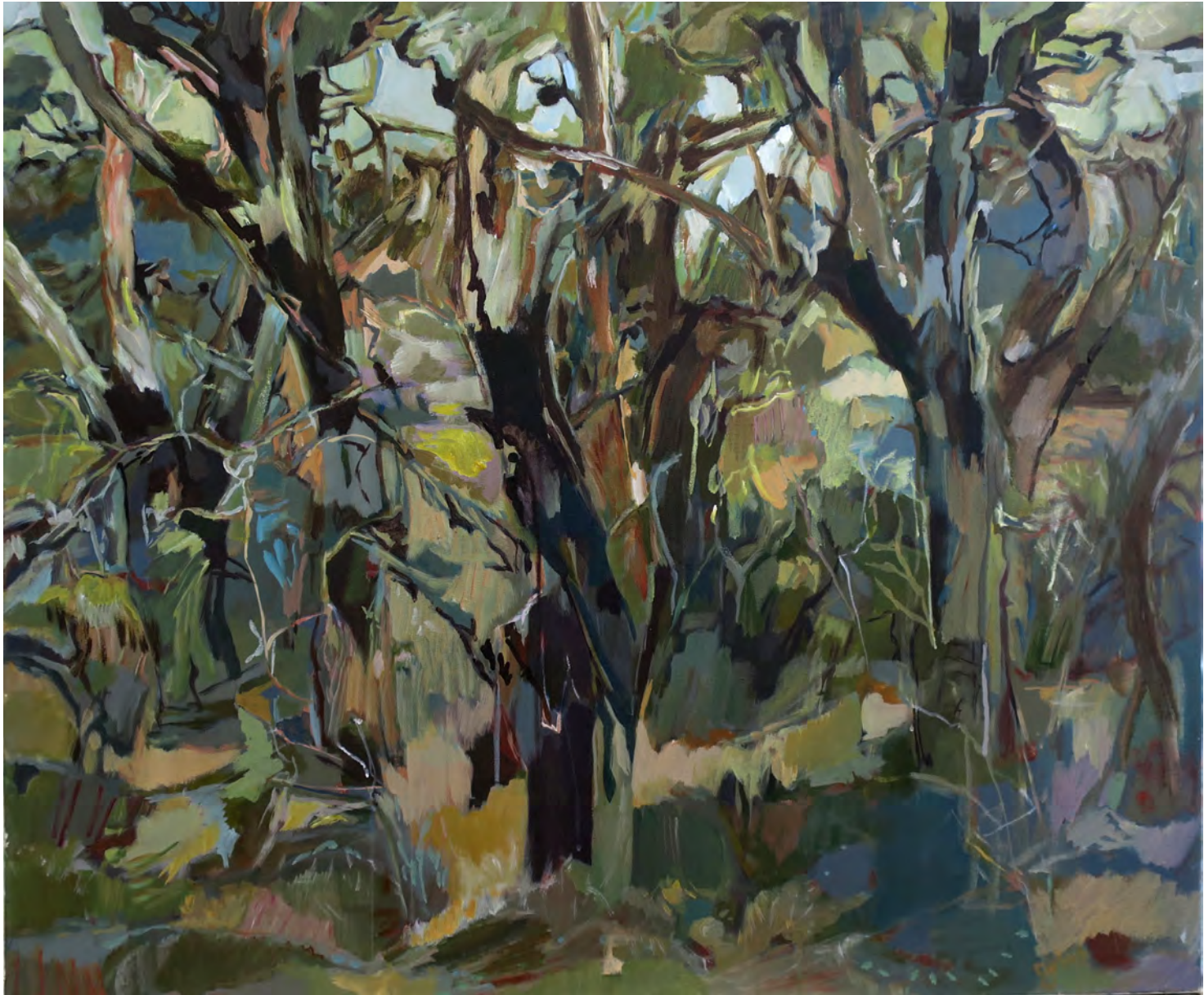
Bush Heart acrylic on canvas 80 x 95cm 2019