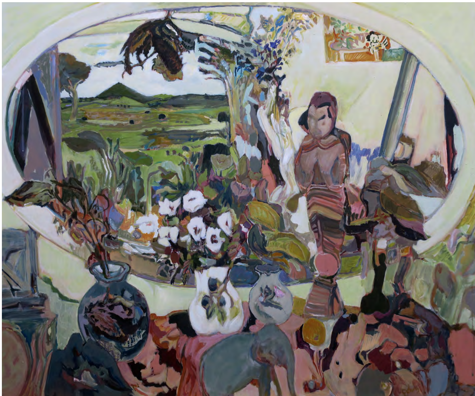
Mirrored acrylic on canvas 90 x 110cm 2021