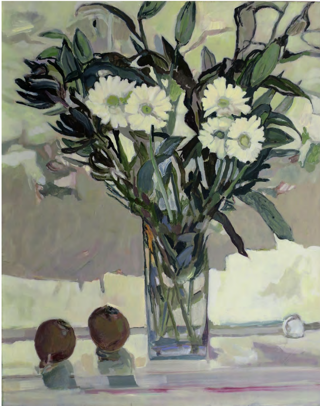
Gerberas and Onions acrylic on canvas 76 x 61cm 2020