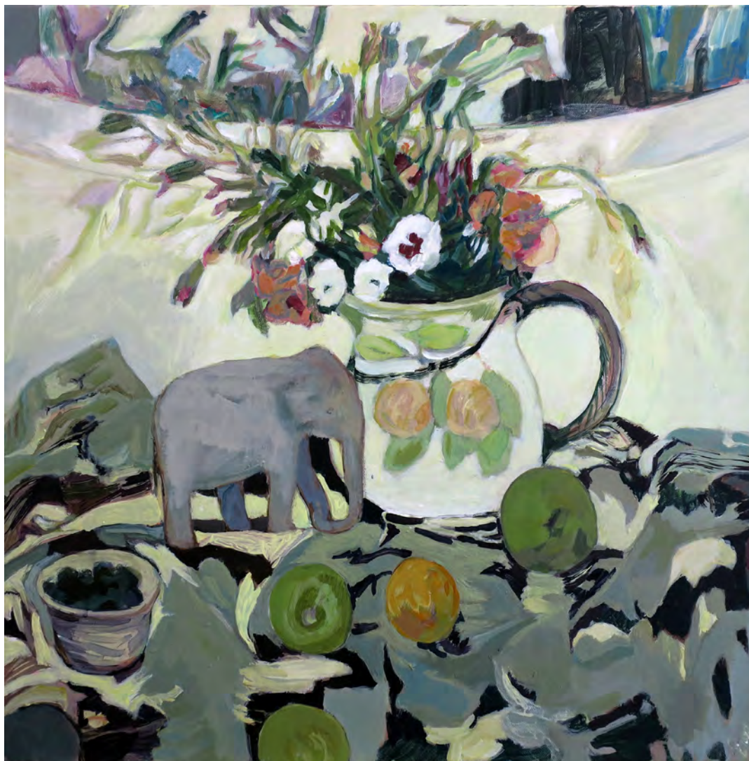
Elephant on Patterned Cloth acrylic on canvas 60 x 60cm 2021