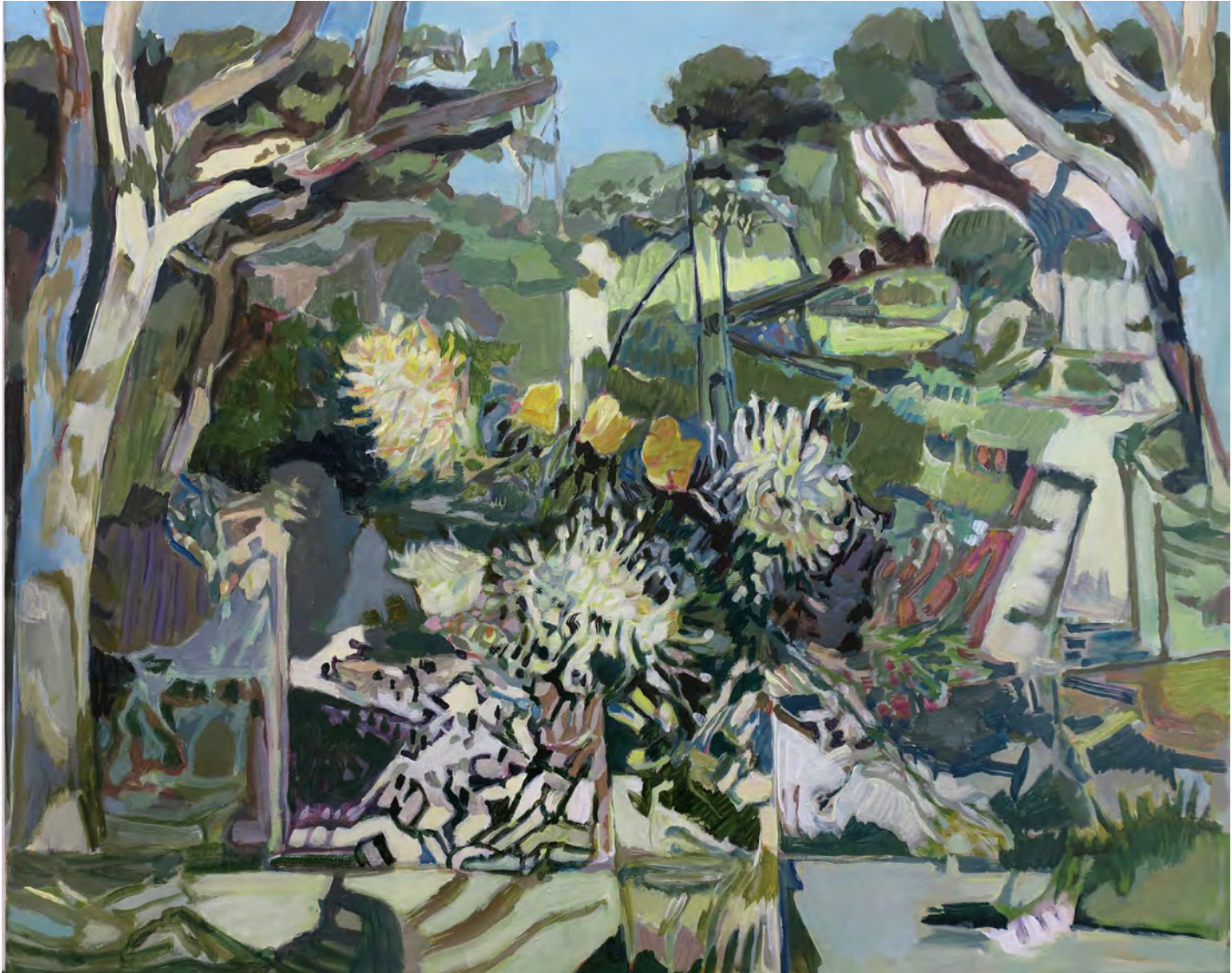
Grevilleas in Window acrylic on canvas 61 x 76cm 2021