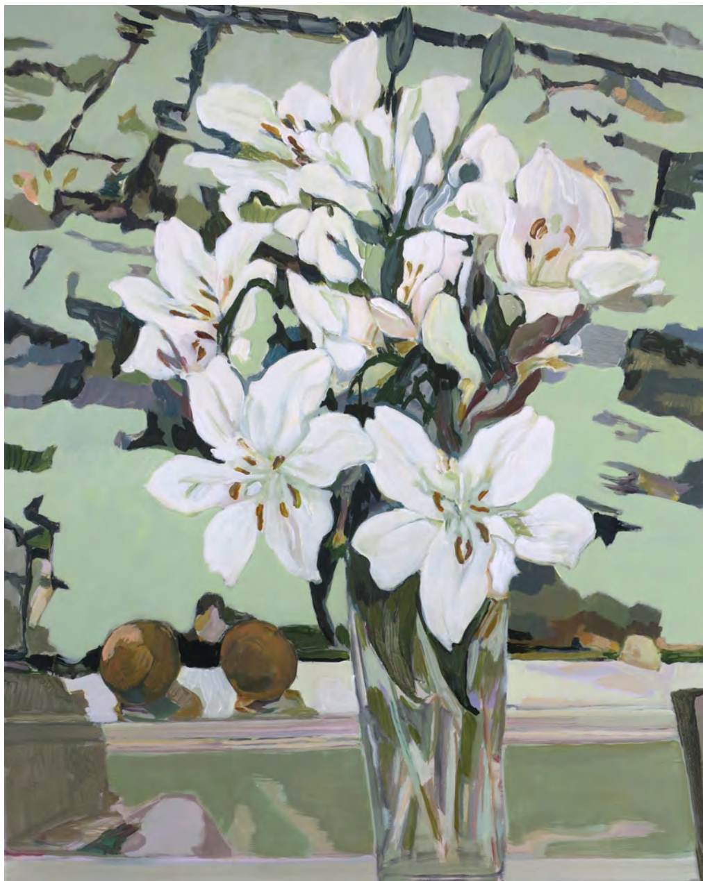
Lilies of the Field acrylic on canvas 76 x 61cm 2020