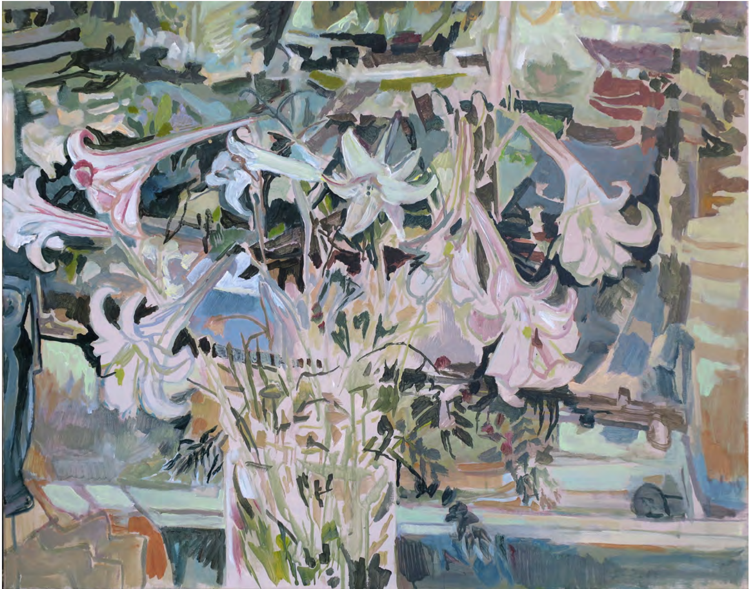
Animated Lilies acrylic on canvas, 61 x 76cm 2020