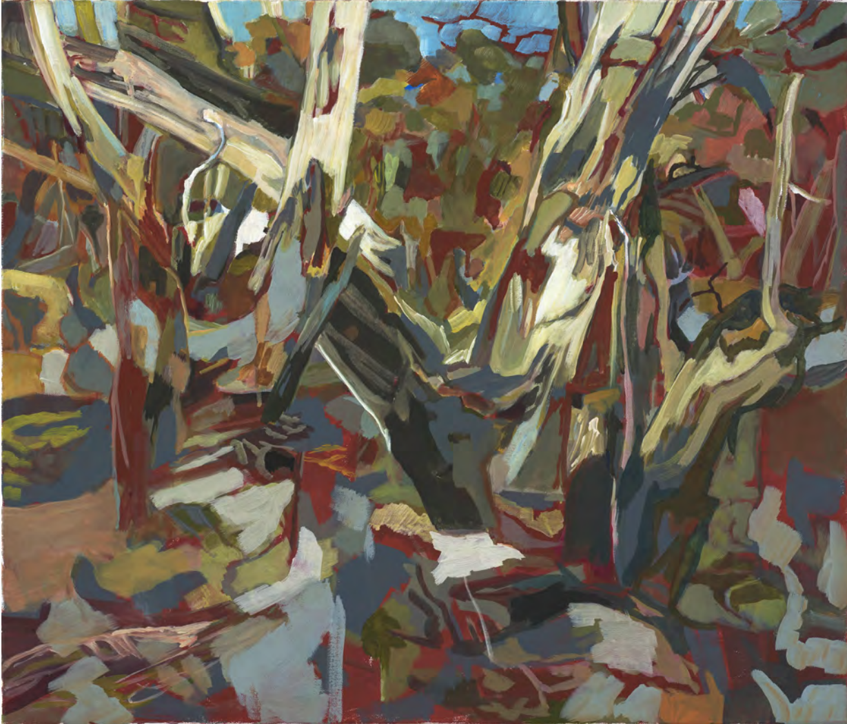
Endurance acrylic on canvas 60 x 70cm 2019