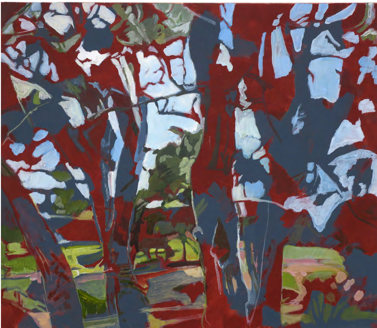
Stasis acrylic on canvas 60 x 70cm 2019