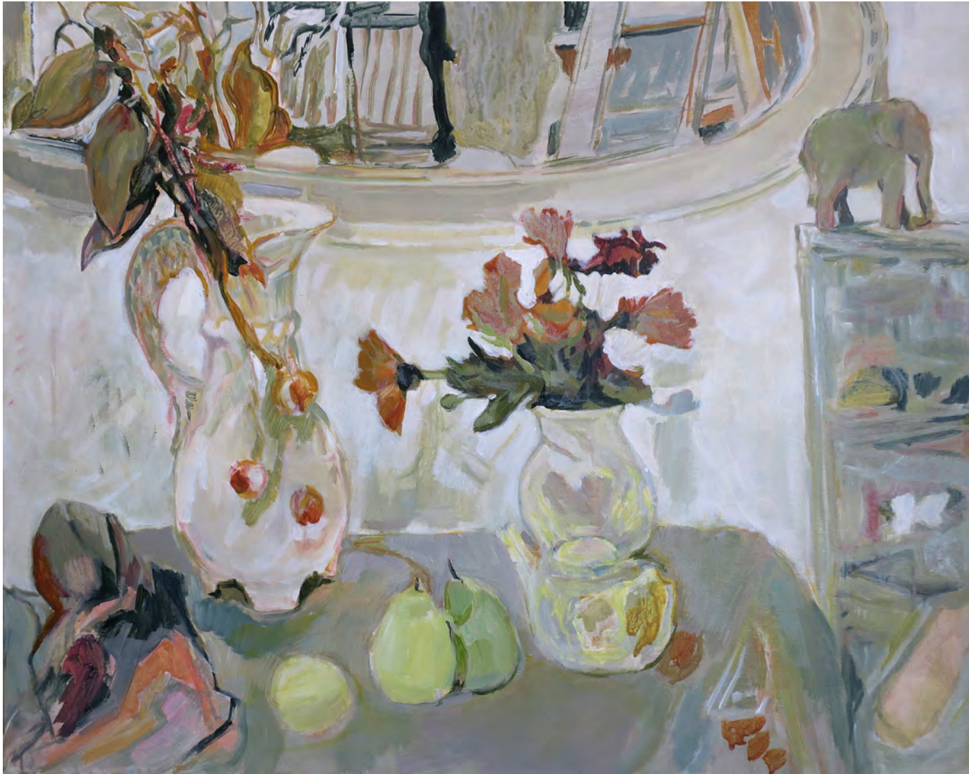
Painting for Loss of Meaning acrylic on canvas 61 x 76cm 2020