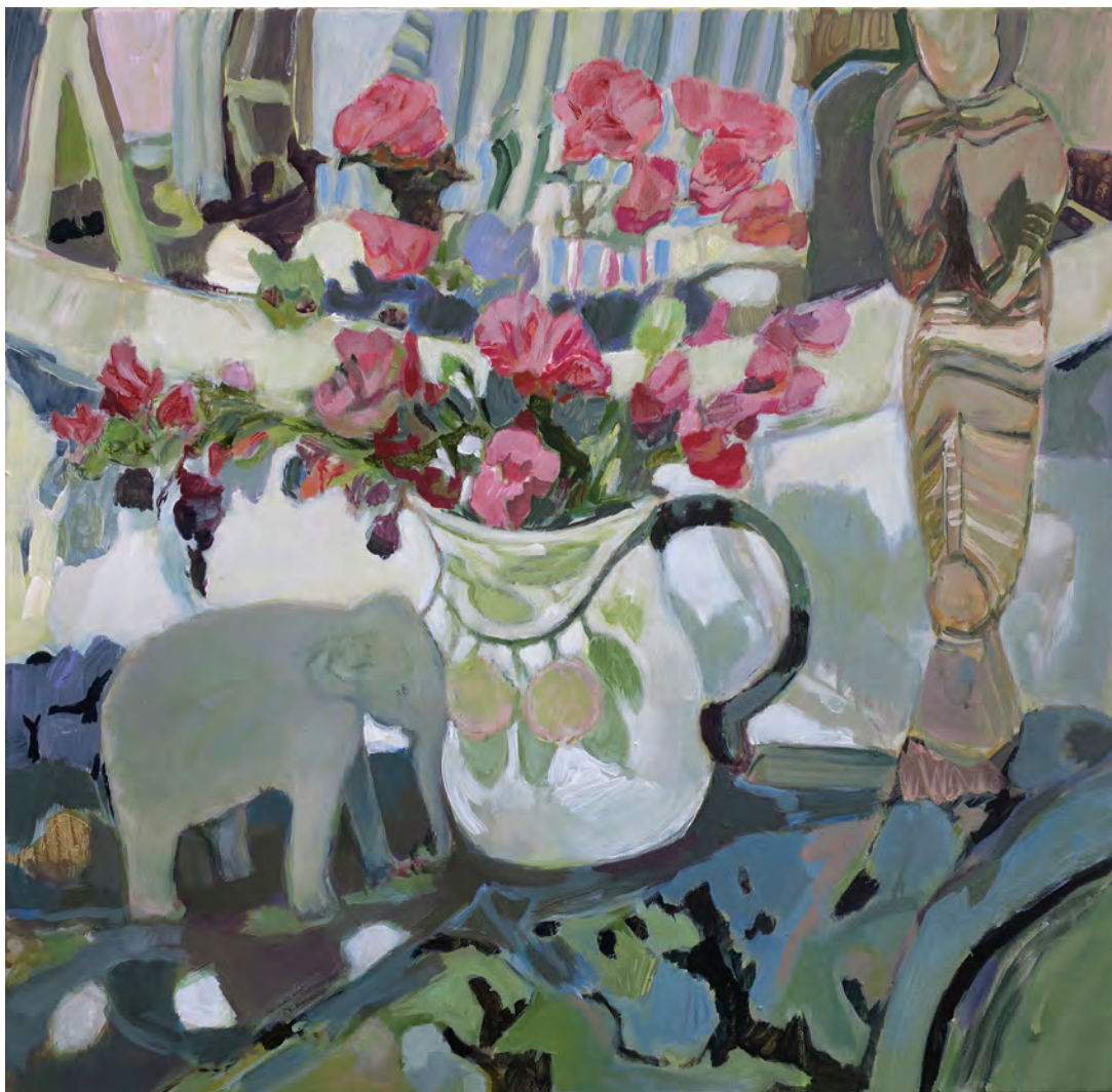
Jug of Roses acrylic on canvas 60 x 60cm 2021