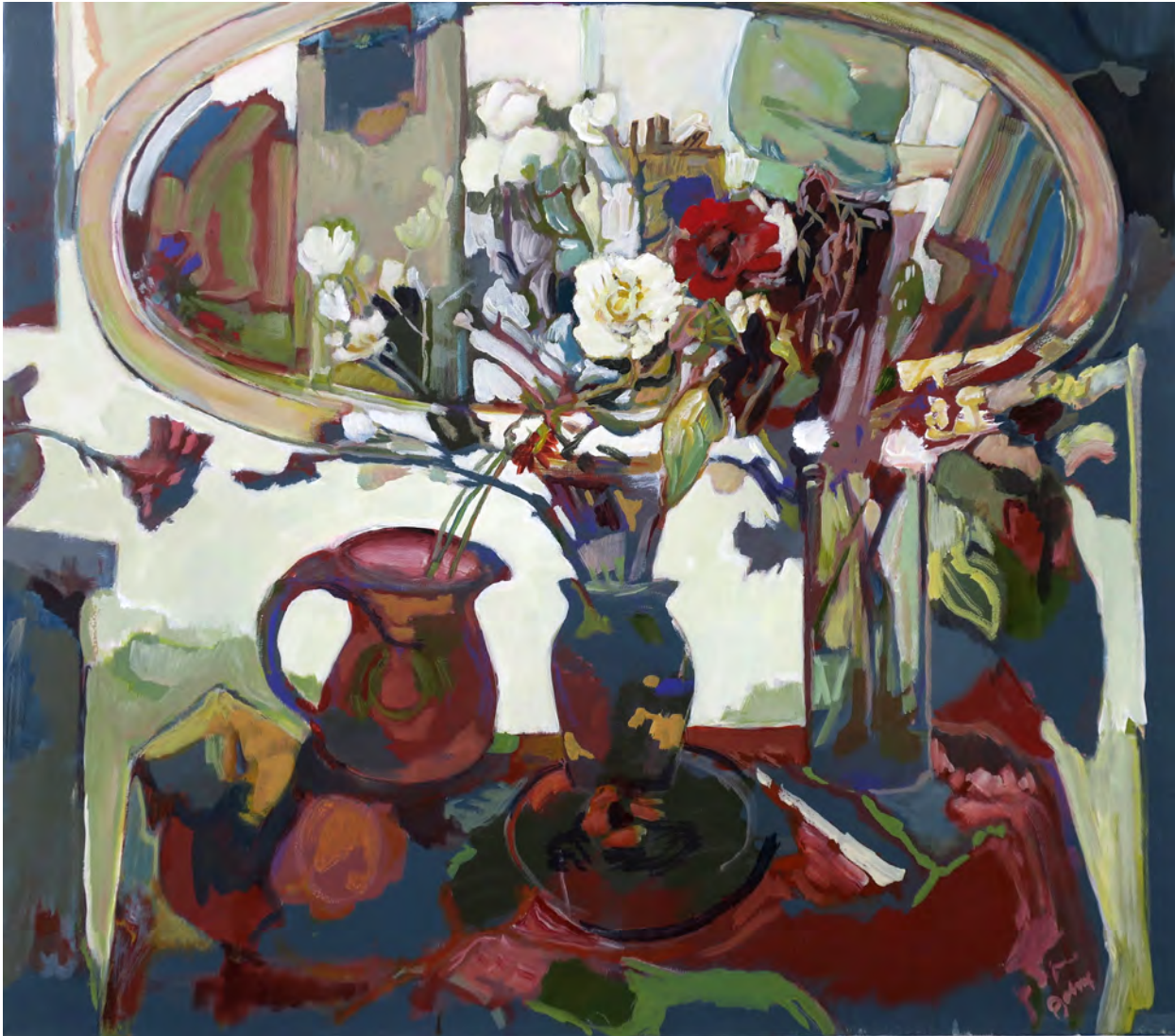
Oval Mirror acrylic on canvas 60 x 70cm 2019